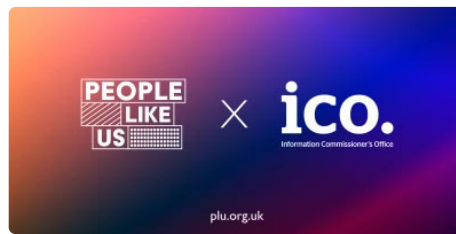
People Like Us x ICO logos

This event will be from 6–9pm on Thursday 14 March at the London Office. Tickets will be available directly through the People Like Us website from 14 February.