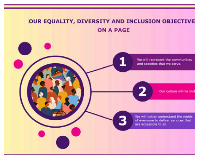
Our EDI objectives on a page

Events like our PLU collaboration support this. It helps drives awareness of the work