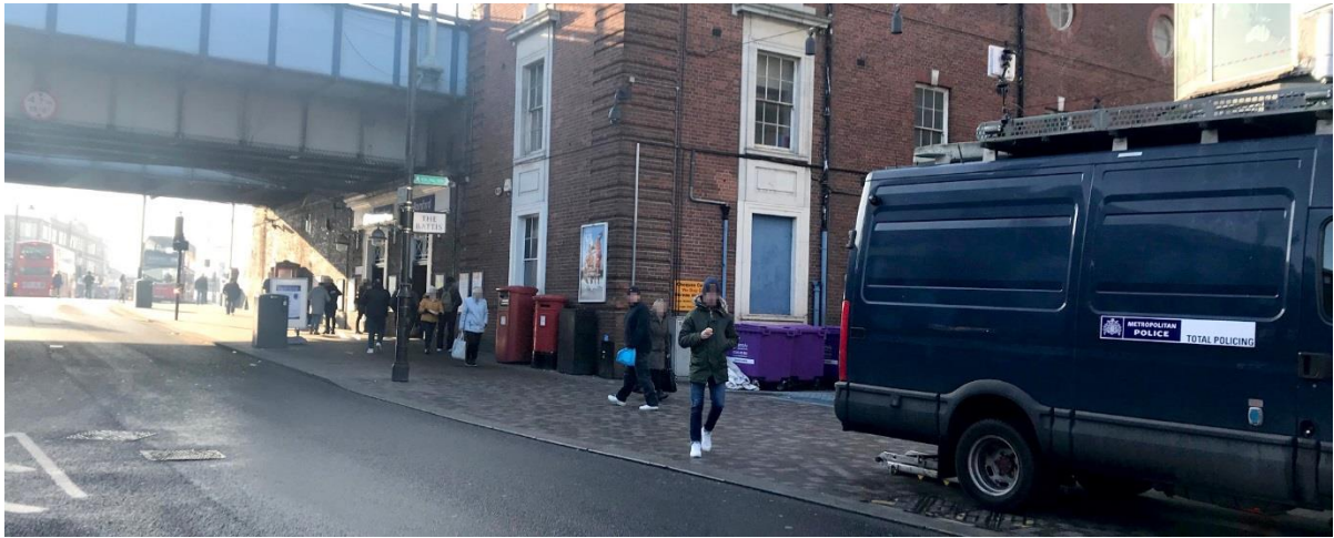
Figure 5 - MSP deployed signage at the exit to Romford station, seen below the viaduct. Members of the public would already have been captured by the camera stationed on the van (to the right of the picture) before seeing the signage.

environments where signage arguably blended into the advertisements from shops and services. (SWP in Cardiff – figure 4).