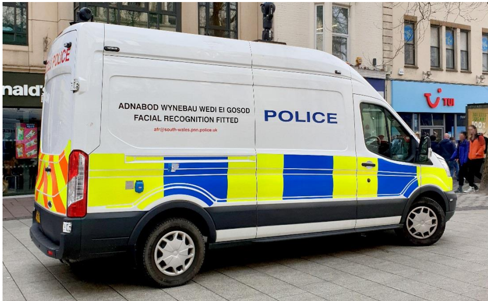
Figure 1 – Marked van used by SWP

During the MPS and SWP LFR deployments, we have seen a range of interpretations of this. It was of particular concern that the MPS used an unmarked van during their Westminster deployment. However, SWP used a clearly labelled van, stating LFR technology was in use including an attributed email address.