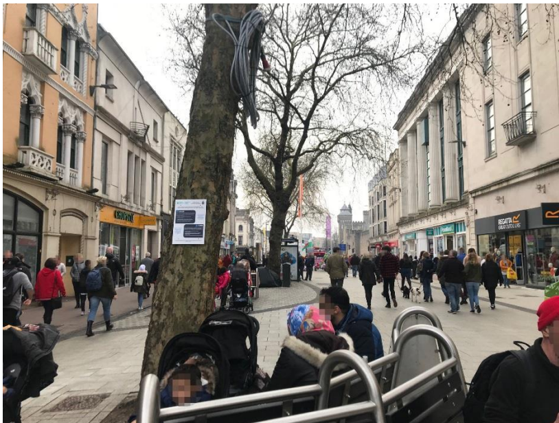
Figure 4 - SWP Six Nations signage

Under s44 of the DPA 2018, forces have various duties about what information they should provide to members of the public. For example, the purposes of processing activities and how individuals can exercise their data rights. Forces must decide how to best communicate this to the public – either through signage and leaflets used during deployments, information on their website or a combination of approaches. Police forces should also make use of their website and social media platforms to inform the public about their LFR schemes in general, and of planned deployments.