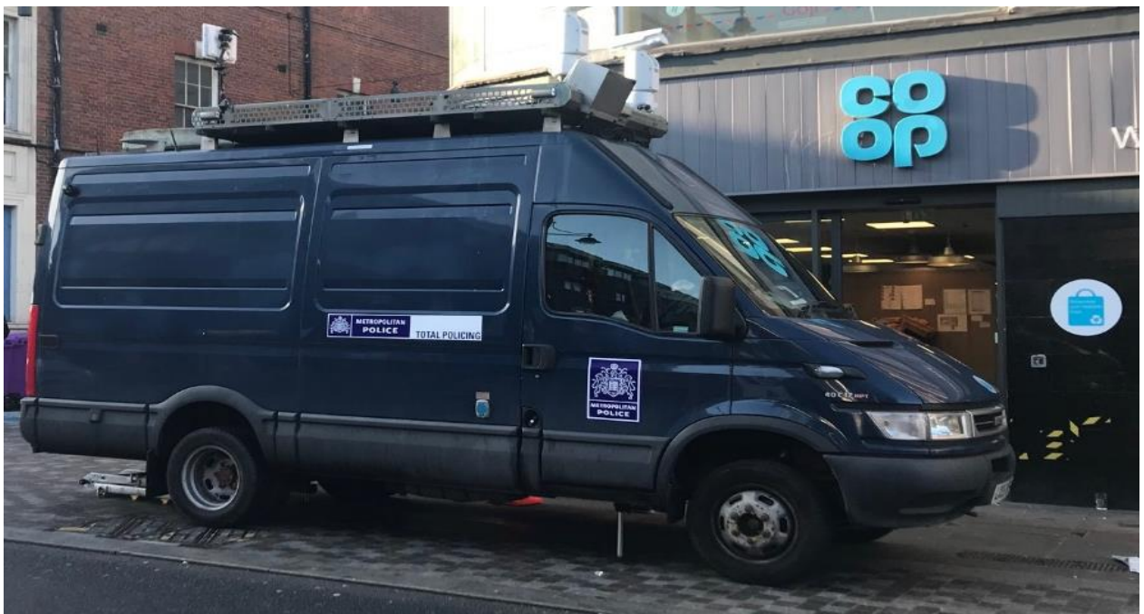
Figure 3 – partially marked van used by MPS in their Romford deployment