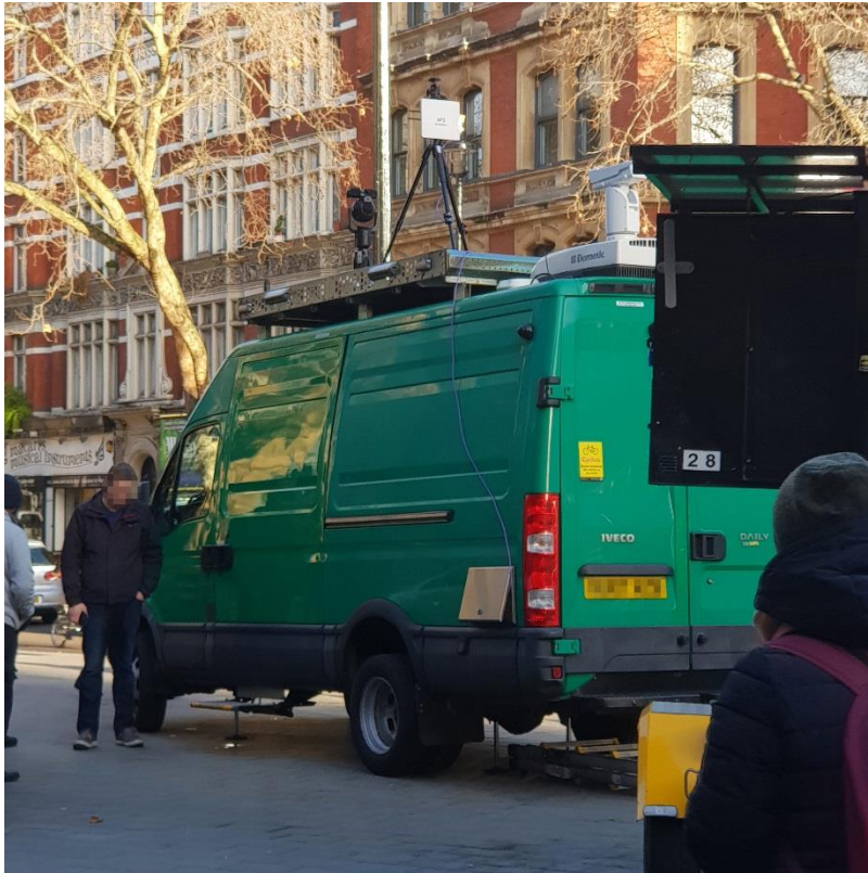
Figure 2- Unmarked van used by the MPS in their Westminster deployment