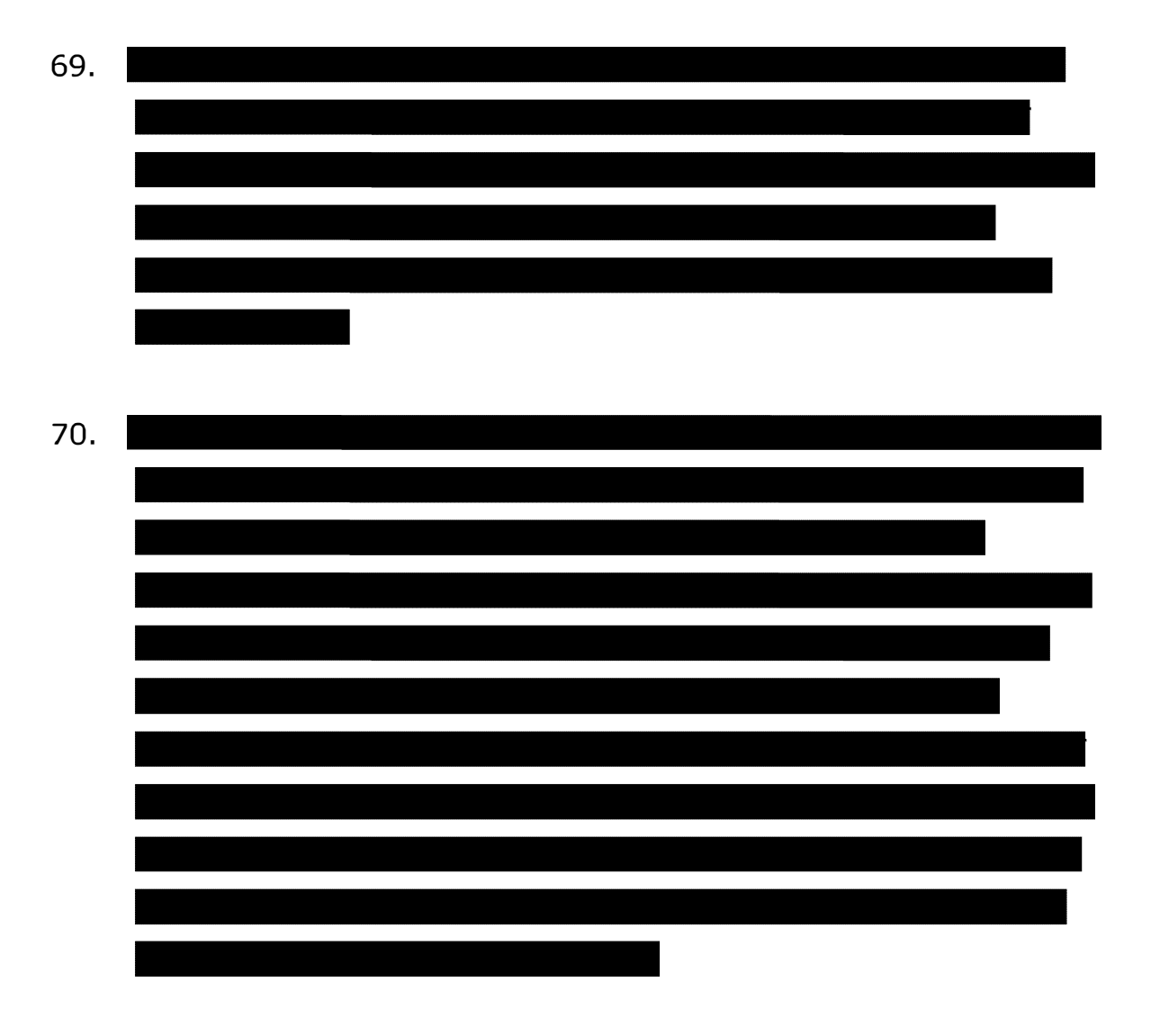
Category D: Article 21 GDPR

71. In the light of the Preliminary Enforcement Notice and the Audit, Experian has carried out remediation work to address the breaches related to Article 21 GDPR identified by the Commissioner. Having considered the steps taken, the